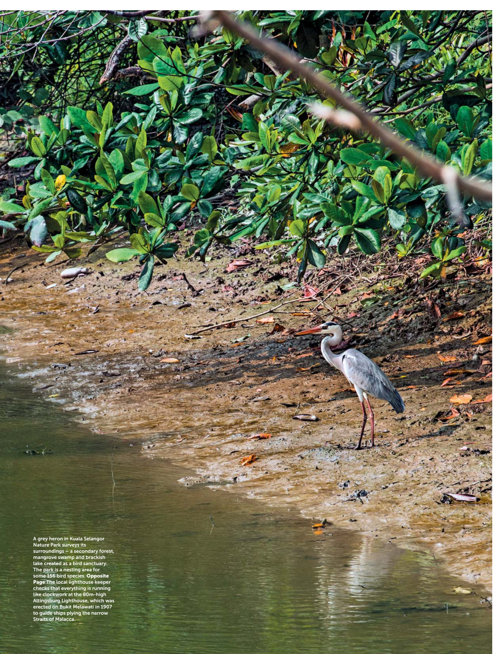
A grey heron in Kuala Selangor Nature Park surveys its surroundings – a secondary forest, mangrove swamp and brackish lake created as a bird sanctuary. The park is a nesting area for some 156 bird species. Opposite Page The local lighthouse keeper checks that everything is running like clockwork at the 80m-high Altingsburg Lighthouse, which was erected on Bukit Melawati in 1907 to guide ships plying the narrow Straits of Malacca.