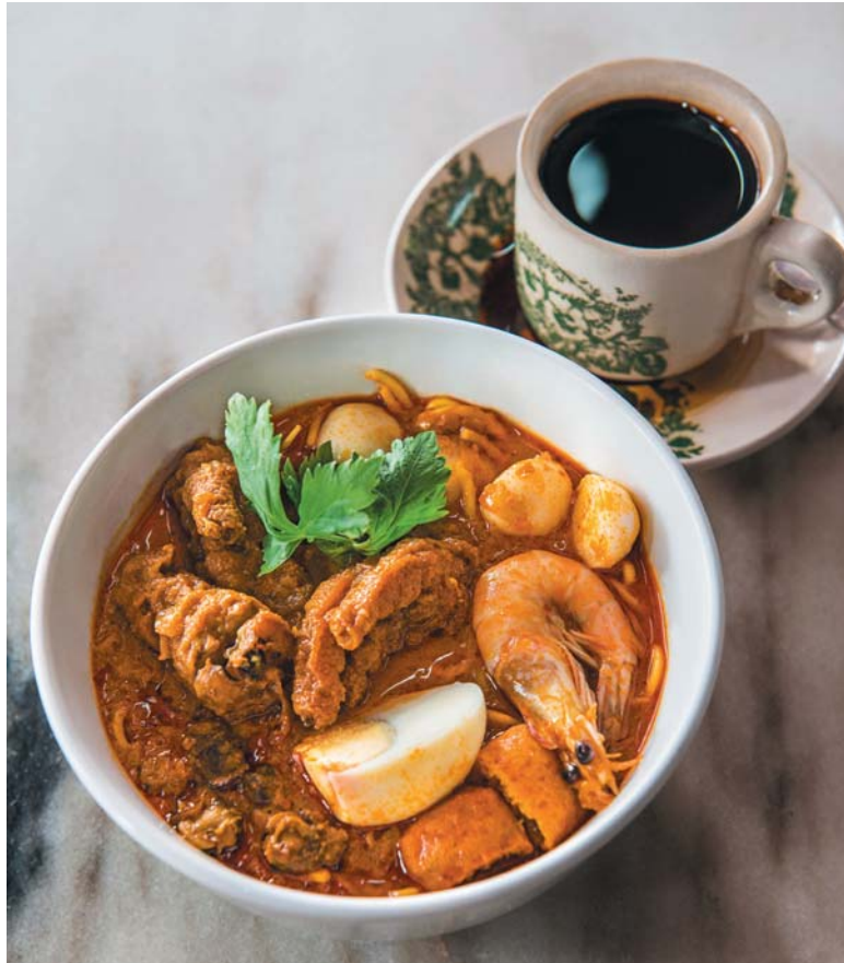
1. Auntie Kopitiam, which opened in 1935, is a typical Hainanese coffee shop serving toast with homemade kaya (coconut jam), kuih lempeng (local pancake), as well as their signature: curry noodles with hard-boiled egg, prawns, bean curd, fish balls and chicken feet. Opposite Page A local fisherman relaxes in the veranda of his colourful home in Pasir Penambang. There are around 200 households in Pasir Penambang and most of the residents trace their roots to Southern China.

snakehead) and kap perak (silver carp), as well as exhibits of nets, traps and implements used by Selangor's fishing community.